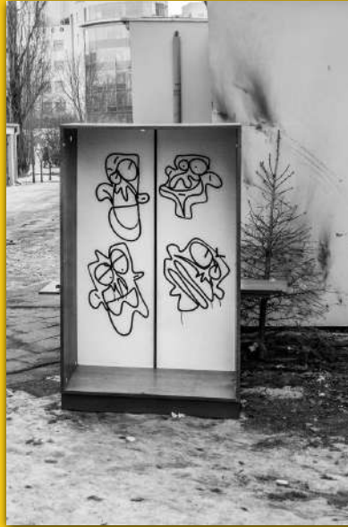
• Post „Miroslav Tichy“

Tichy became an outcast, a misfit. At that time, he decided to wander around the city with a camera he constructed himself. The camera included parts that Tichy found in the dumpster. His goal was to photograph women from hiding. Tichy became a voyeur. He did this continuously until 1985.