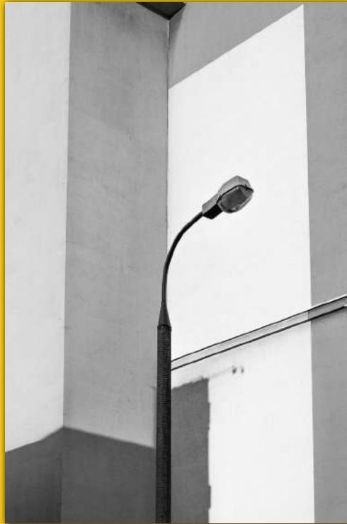
• Post „Patience“

Nevertheless, fame is not the goal of my photographic adventure. Whatever we do with our passion, we should remain calm, be patient, and consistently do what we want to do. I regularly take photos on the streets of Warsaw since October 2015. Besides, from September 2017, I added website management to my daily routine. Another activity that has helped me do all of the above is reading books. I started reading and ticking quotes in books regularly in 2011. All of the above activities have one factor in common: patience and consistency. I want to grow with my passion like a tree grows: consistently and as high as possible, but at the same time without rushing. I believe we should be authentic in what we do. Authenticity, persistence, and patience - I think these three things are critical to success not only as an artist but in our passion in general. Regularity is perhaps the most challenging thing to achieve in developing healthy habits. I have already mentioned in previous posts that the drop hollows the rock. Let's focus on a long-term goal. Then, step by step, day by day, month by month, year after year, let's patiently do what we want to do in the context of our hobby. The reward should come sooner or later.