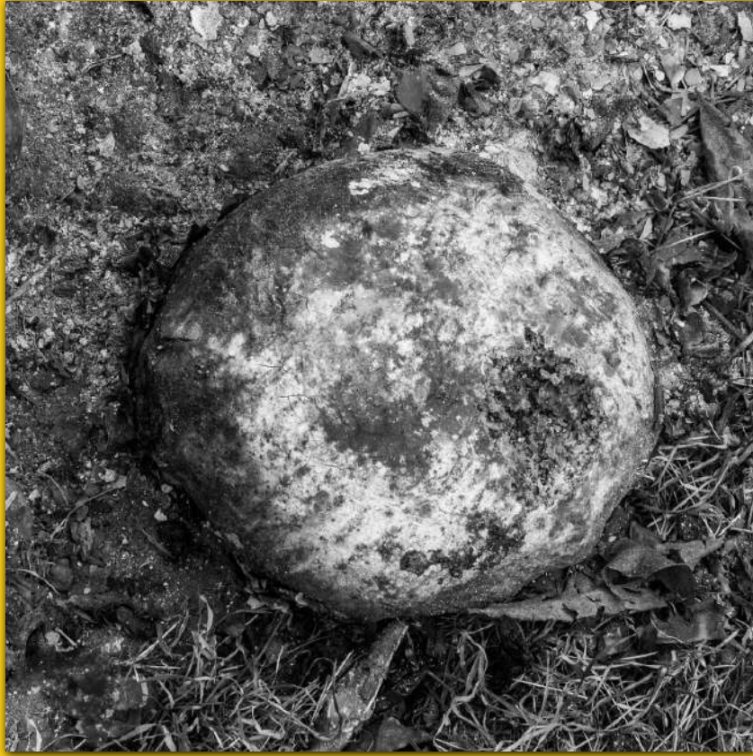
• Post „David Bowie“ (also p. 19)

I have written about David Bowie many times in my previous posts. I am convinced that I will come back to the famous British singer's works also in the future. In the post "David Bowie," I wrote about his songs and artistic legacy in general. The results of the famous artist inspire me practically all the time. David Bowie's vocals give me real motivation to be creative, both in writing and photography. I am 100% sure that David's songs will continue to appear in my life until the very end. The frequency of listening to his songs will change for sure, but I know I will not stop listening to his songs. The work of the legendary artist encourages me to write about his tunes. I have already written some posts inspired by a British artist. Here they are: "Is there life on Mars?" "Warszawa," "Rebel Rebel," "Space Oddity," or "TVC15." Best of all, I know it is only a matter of time before I will write more articles about his other works such as "Changes," "Moonage Daydream," "Drive-in Saturday," "Starman," or "Modern Love."