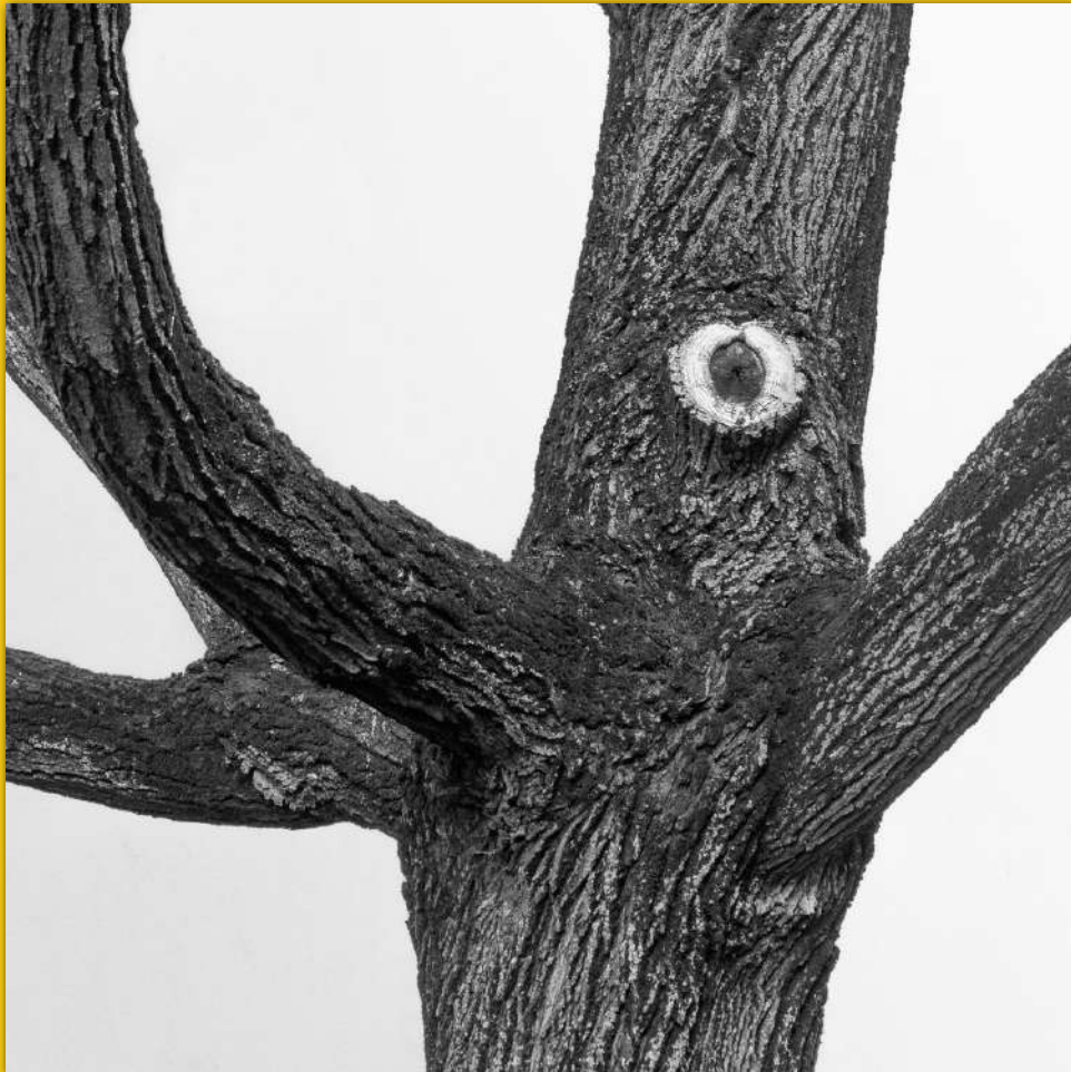
• Post „David Bowie“

As with other things, I need time to develop something specific to write lyrics inspired by Bowie songs. I will undoubtedly try to transform them into my own artistic language, related to, e.g., photography. I am convinced that giving myself time to write more stuff will bring me many benefits. If I don't know what to say about the song "Drive-in Saturday" for today, I know it's only a matter of time before something interesting will come to my mind in the future. A similar phenomenon occurred for me in the context of the preparation of my website. Before I created it, I took a lot of photos on the streets of Warsaw. Wandering the Polish capital streets, I did not know when and how I would present my pictures to a broader audience. I gave myself time for this. Now everything you see and read on this page is proof that your hard work and patience will be rewarded.