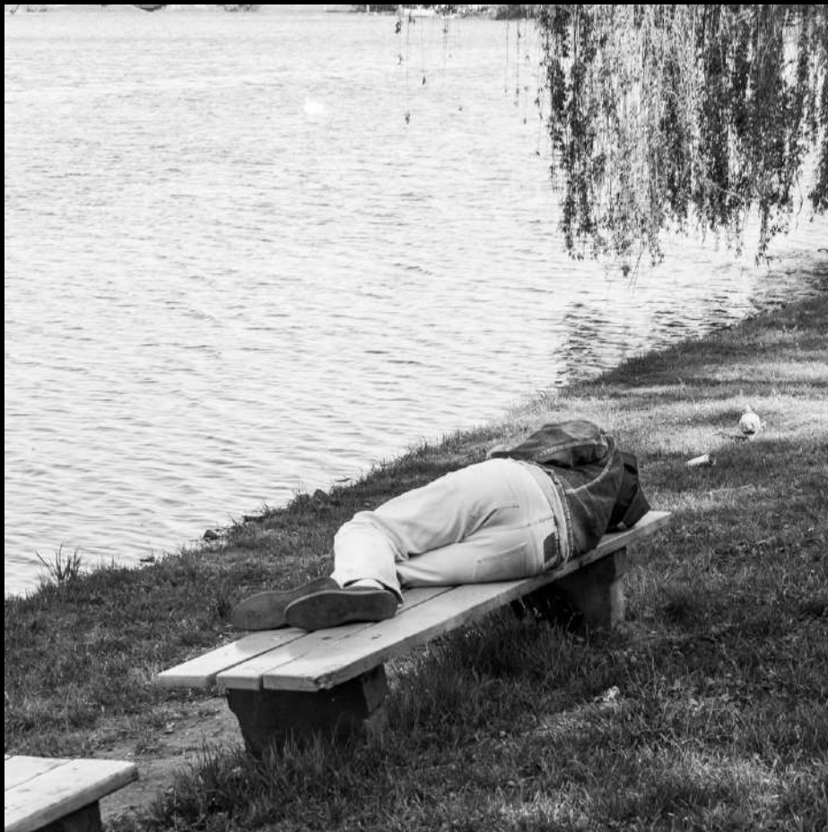
• Post „Shooting pictures of the strangers“ (also p.15)

All I know is that Facebook asked me one last time if I wanted to introduce face detection on my private profile. I agreed. From now on, the portal will inform me if someone adds my photo to their profile. I am happy with this option, and at the same time, I am afraid of all these changes related to privacy. However, I know one thing: I'm honestly glad that I didn't create too many street photos with visible human faces. If these kinds of images were the core of my passion, I would now have a hard time publishing these images. I'm glad I don't have too many problems with that right now. Overall, taking photos of other people is not my greatest passion. I think the people who do traditional street photography had more obstacles in doing their job. Upcoming regulations will not make their lives easier.