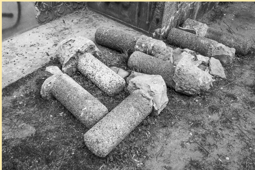
• Post „Motivation“

Nevertheless, looking at my own photos, I have noticed that they are the ones that give me one of the strongest motivations to continue working. I find it fascinating that walking the same streets for the nth time, I still see new objects to photograph. I often discover the same streets at a completely different time of year or day. Undoubtedly, my photographs provide me with a constant flow of artistic inspiration and motivation to work.